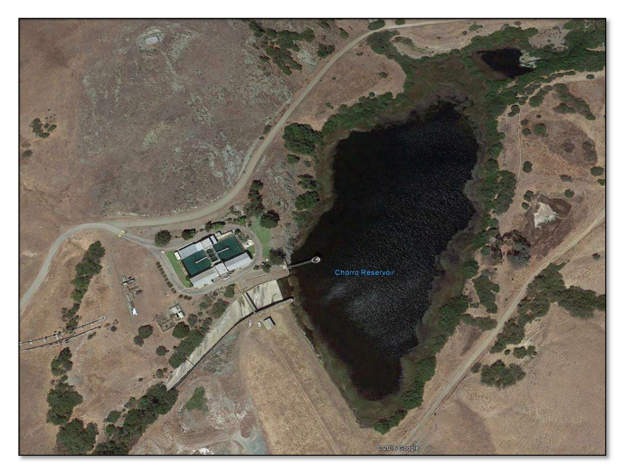
Figure 2. Chorro Reservoir.