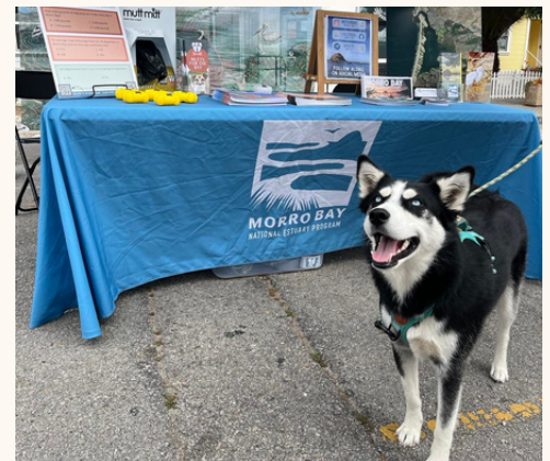
MUTTS FOR THE BAY