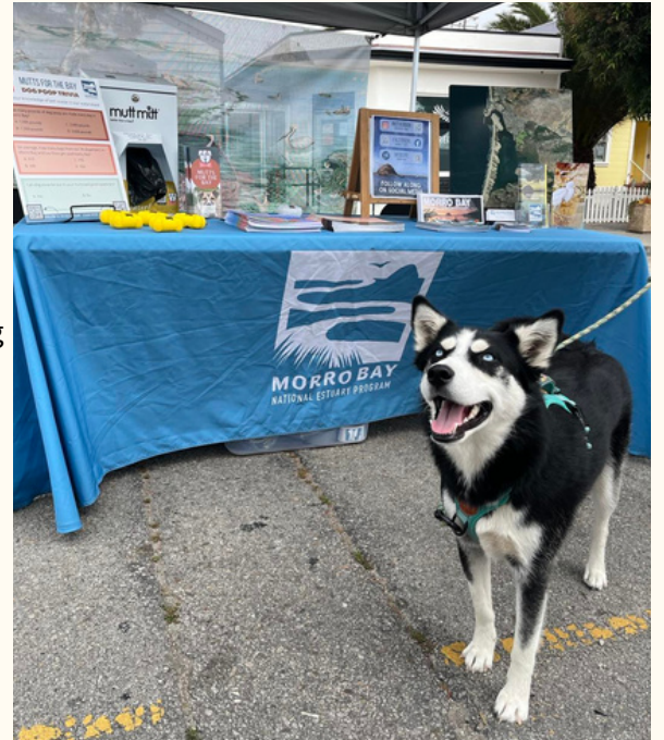
Catch the Estuary Program at various events to learn more about Mutts for the Bay, test your knowledge with Dog Poop Trivia, and grab a free bag dispenser for your leash so you'll never be caught without a bag.

Our Mutts for the Bay program maintains 36 dog waste bag dispensers throughout Morro Bay and Los Osos with the help of a dedicated group of volunteers. The program is supported by donations from individuals and local businesses, as well as a generous grant from the Harold J. Miossi Charitable Trust. This program not only provides free dog poop bags throughout the community but also educates folks on how to be an eco-friendly dog owner. Stay tuned for new materials from our Mutts for the Bay program, including new stickers, brochures, children's activities, and more. Catch us at farmer's markets and hosting Mutts for the Bay cleanup efforts and dog-friendly parks and trails!