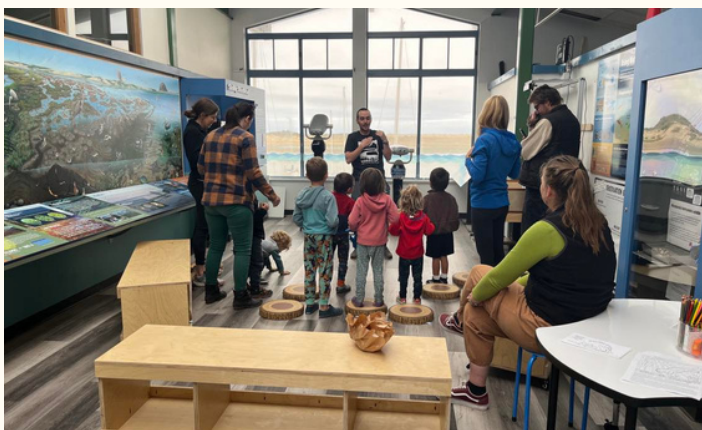
In June, Sea Otter Savvy taught us all about sea otters. In July, Woods Humane Society and New Life K-9s focused on humane and eco-friendly pet ownership and highlighted our Mutts for the Bay program.

The Estuary Program has a free-entry Nature Center upstairs at 601 Embarcadero in Morro Bay. The Nature Center is an ideal place to host field trips and events, and this summer we started a Nature Center Science Storytime program. Every second Saturday from June to August, we cohosted a story time and craft with a partner organization.