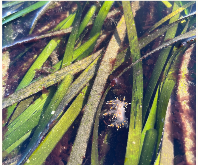
Eelgrass creates habitat for algae and sea critters—including this red algae ( Smithora naiadum ) and white-and-orange-tipped nudibranch.

The challenge with mapping eelgrass is that it grows both in the shallow intertidal and deeper subtidal zones. Throughout spring 2023, sonar technology was used to map eelgrass at deeper depths while drone aerial imagery was used to survey exposed mudflat areas at low tides.