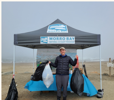
EXPANDING COMMUNITY ENGAGEMENT