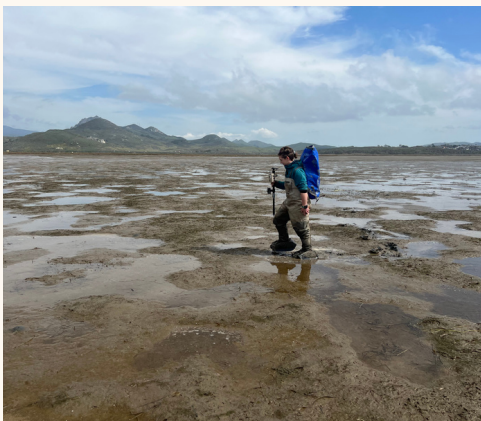
MAPPING MORRO BAY'S EELGRASS