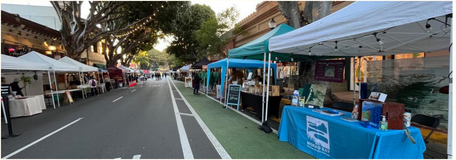
Catch us at the Downtown SLO Farmers Market up to four times a year. We would love to answer any questions you have, talk about volunteer opportunities, and give you some free materials and stickers!