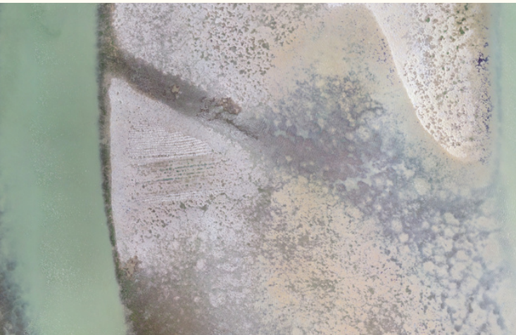
Image from drone flight. The brown textured patches on the image are eelgrass.