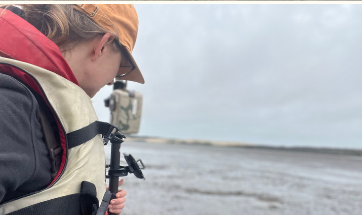
In Spring 2023, Restoration staff conducted groundtruthing in the estuary using high-accuracy GPS units and site photos.